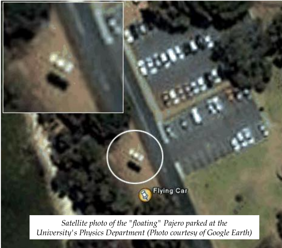
Satellite photo of the "floating" Pajero parked at the University's Physics Department

cycle batteries strategically placed along the length of the car and wired to the iron chassis was to be used to generate the magnetic field while gyroscopically controlled-ion thrusters powered by solar cells were to be used to stop lateral movement.