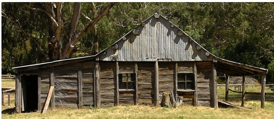
The New Monastery for Wiruna (Currently Located in the Victorian High Country and under offer by the Society)

The main building will be a recycled, larger scale version of the eat-in-kitchen, and to encourage the true spirit of self-denial, sleeping will be done on grass mats on a concrete floor in sleeping bags fabricated from desiccated eucalyptus leaves.