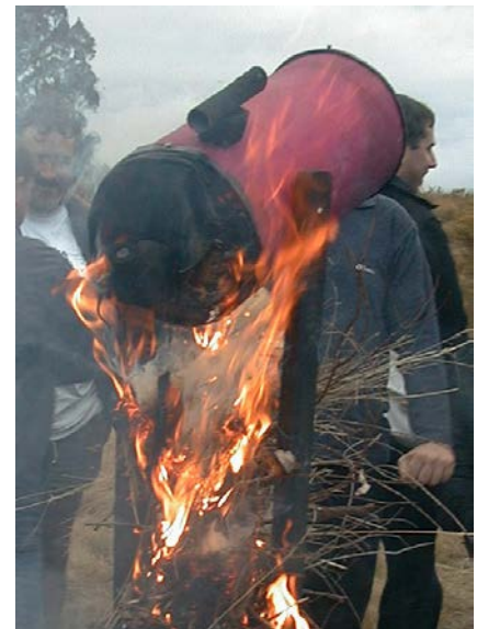
Spontaneous Combustion of a Telescope due to Global Warming

As a health and fitness conscious freak, he has designed a series of meditations to slow the heart rate, and hence the rate of breathing and CO 2 exhalation.