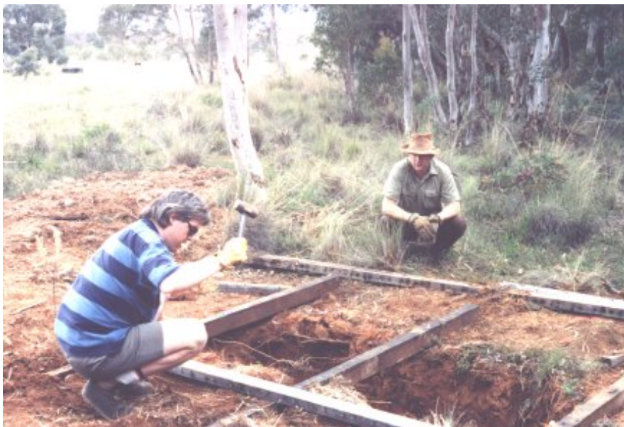
Preparation of the Lawn Cemetery at Wiruna

Members are asked to postpone dropping off until at least 2004, as we do not feel that the site will be ready to receive guests until then. As a special public duty, the Society offers to the Australian public at large a free service to self confessed intellectuals, retired politicians, and media gurus.