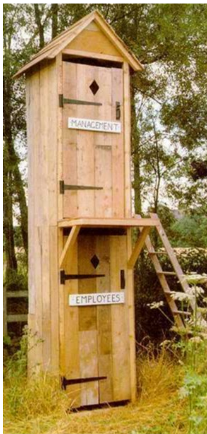
Two-Storey Prototype of the Proposed Three-Storey Dunny

class scientific facility, and unique in the astronomical world - a Quad-Telrad Comet Seeker, the only one residing inside a giant replica of an Australian icon.