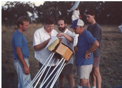
Which End Does the Mirror Go?

taken on the matter before the telescope was finally assembled.