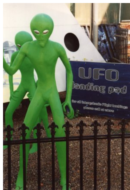
UFO Landing Pad

Disused 1 hectare former UFO landing pad at Wycliffe Well, nicely situated half-way between Tennant Creek and Alice Springs.