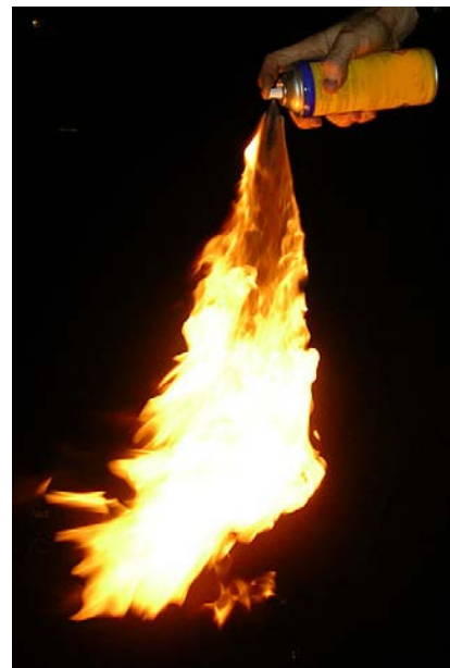
The Portable Instant Optics Demister In Action

However, from New Zealand again, the Land of the Long White Cloud, lots of rain, fog, dew, and damn few clear nights, comes a product designed to maximise those clear nights and give instant dew zapping.