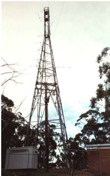
35m Radiotelescope Tower

After some careful research, the simple expedient is being put into effect - that of placing it closer to the radio sources being studied. A surplus 35 metre high tower has been secured and will be dismantled and re erected on the western (or upper) observing field by April 2003.