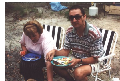
Sampling a Gourmet Recipe

Take one Ukranian Chicken (either 3 or 4-legged is suitable). Cut off both heads and remove all feathers using a blow-torch or angle-grinder. Stew in a lead-lined pot, preferably whilst wearing a cast iron Sporran.