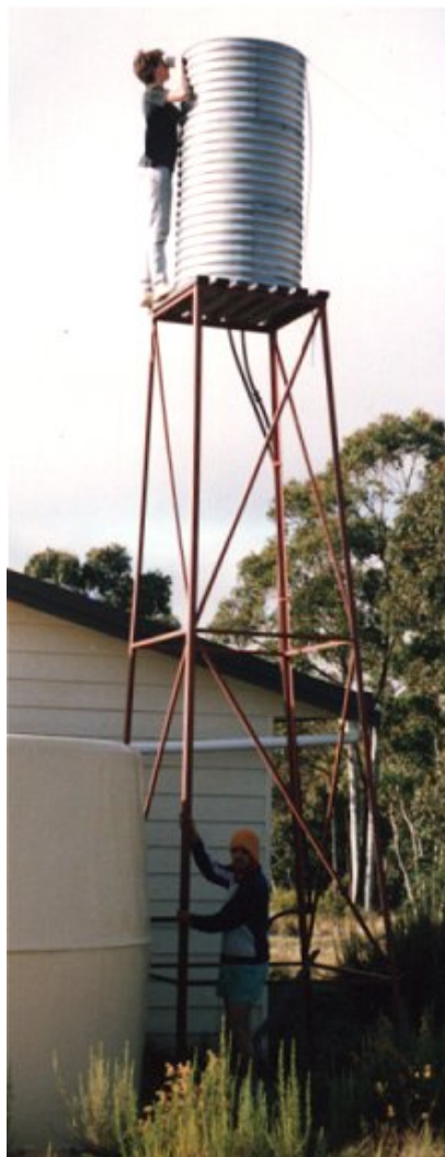
40" f/6 Zenith Scope

toxicity in venom that some persons bitten have recovered, and lived, without the need of medical assistance. Initial tests have been encouraging.