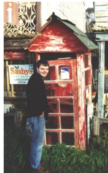
The New Phone Box for Wiruna

The phone box is scheduled for removal from Sofala's main street to make room for the new Cinema complex, Shopping Mall, and Opera House currently being planned by the Darwin Awards Foundation, of Walla Walla, Washington, USA.